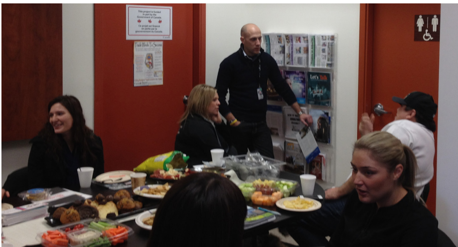
Industry reps were also at open house to meet with those seeking employment.

The Employment & Training Centre would like to invite anyone to stop by anytime and check out the new Career Centre.