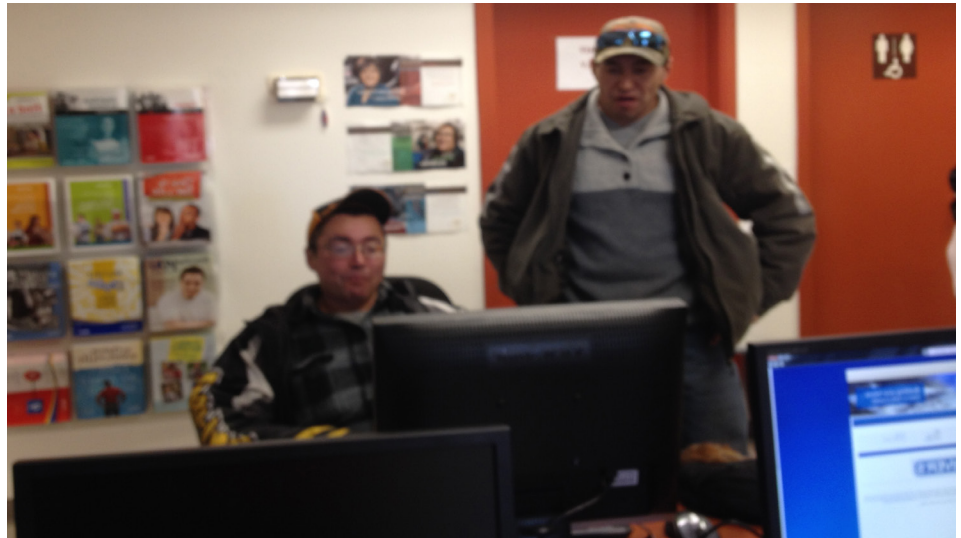
The new computer station features 5 new computers that Employment & Training clients can use on a daily basis.

clients to work independently, but they will gain valuable computer skills including job search, file management, attaching documents, creating email accounts, writing skills, online applications are some examples. In addition more clients can be helped. We have one computer set up in a private office where clients can work on online training, online testing or other employment tasks requiring privacy or concentration. Clients will experience a new level