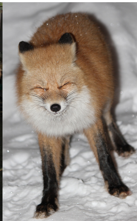
This rez fox was hit by a ski-doo and is now known as "Not Even".