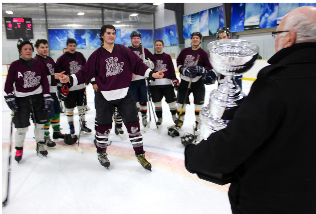
Delivering the goods. This year's Hyde Cup raised $10,000 for Fort McKay's Mobile Food Bank.

A celebration of the new mobile food bank will scheduled for February 28 at 10:30 a.m. at the hockey arena parking lot.