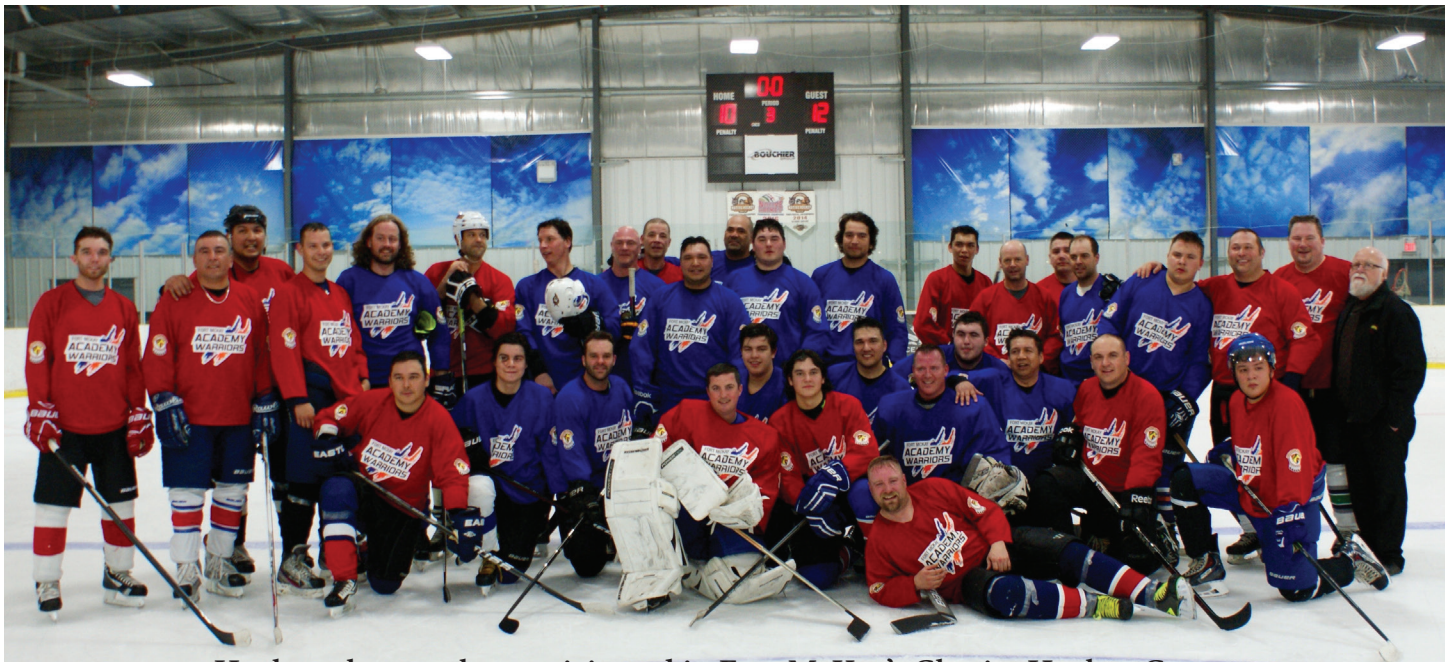
Hockey players who participated in Fort McKay's Charity Hockey Game.