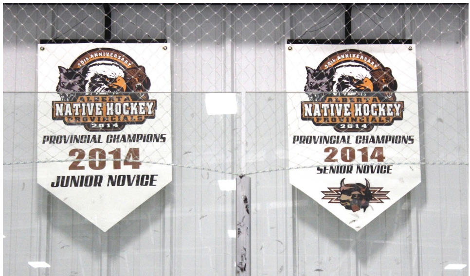
The first championship banners to hang in the new arena.