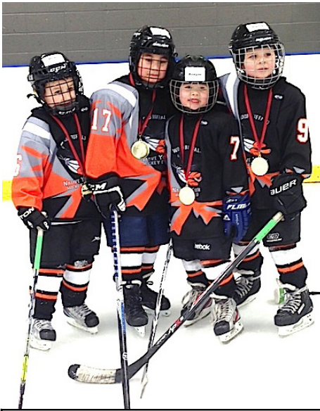
Fort McKay players from the Junior Novice 2014 Alberta Native Hockey Provincial Championship team.