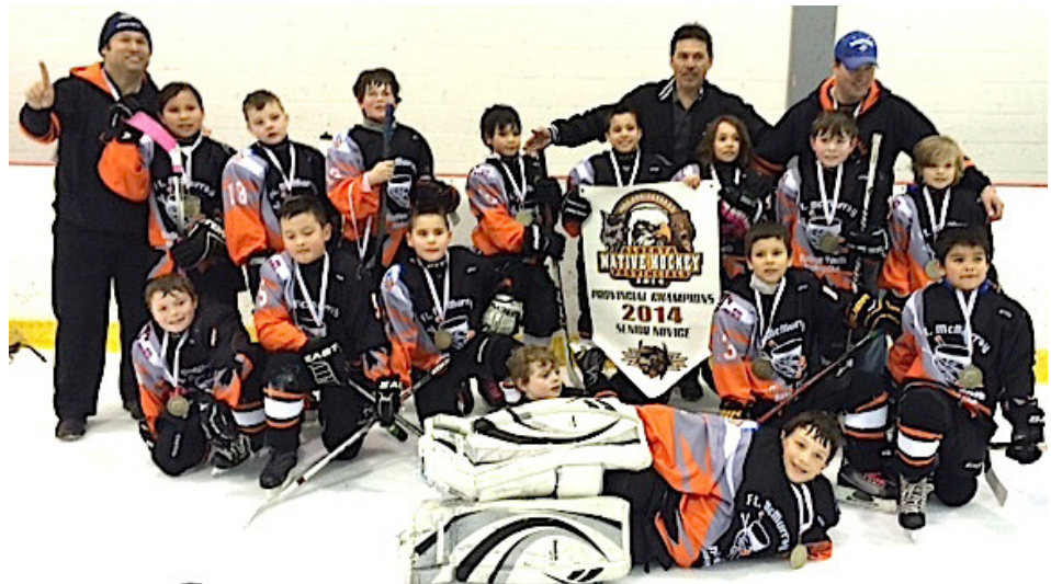
2014 Alberta Native Hockey Senior Novice Provincial champions.