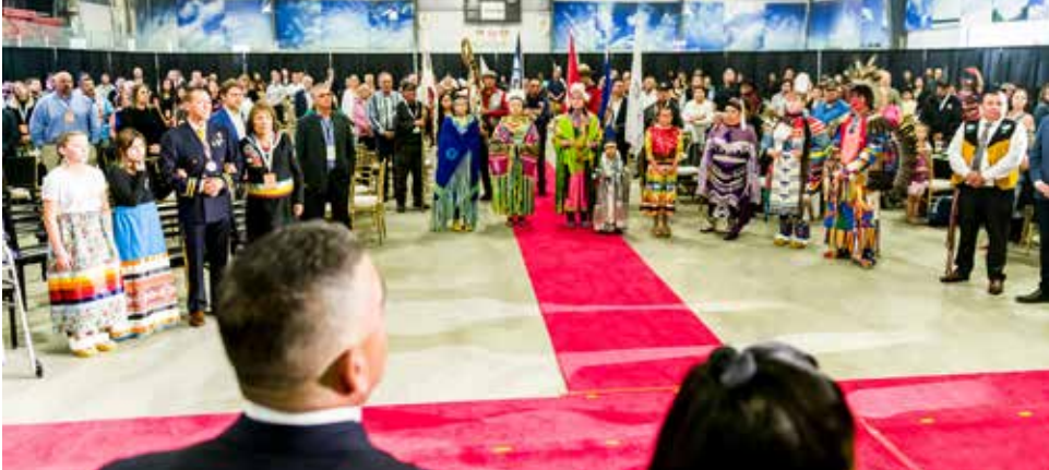
Chief & Council's inauguration featured many family members, community members, dignitaries and invited guests in the Fort McKay arena.

The Inauguration of a Chief and the instatement of the Councillors elected by the community is an important day in the long and successful history of Fort McKay First Nation. We honour our traditions and culture with a ceremony that is symbolic of our people and our ways. The community has placed its trust in this leadership and the Oath of Office Ceremony conveys the significance of these elected roles and their connection to our people and our ancestors, particularly those who led our people in the past.