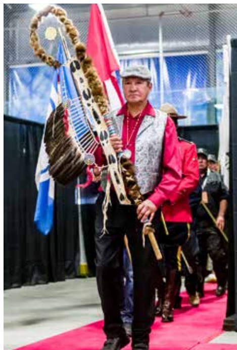
The opening ceremony was led in by the Eagle Staff and flag bearers, and was completed by the Fort McKay traditional dancers.