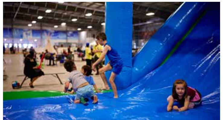
Every year, everyone is welcome to attend Treaty Days. The events go all weekend: Kids Bike Parade, Kids Discovery Zone, Teen Wonder Zone, Cultural Village, and Dene Hand Games. The Fort McKay Idol and jigging contest are supported by the Nicely Put Together Band.