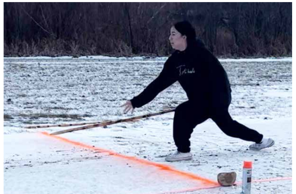
Malibu taking part in the Snowsnake