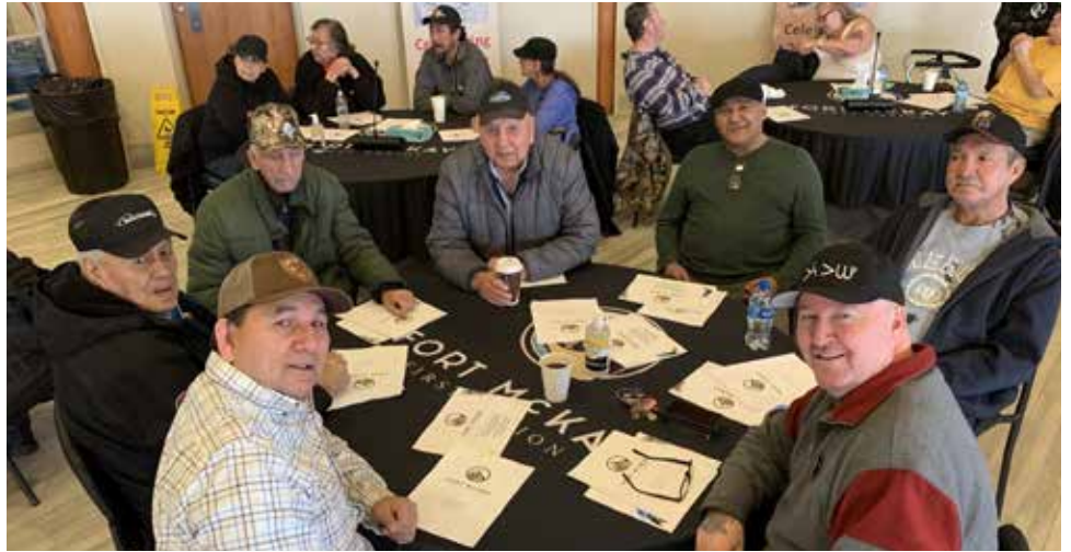
Fort McKay Elders gathered in the Band Hall for the QGM on February 27th.

The Elders' Saint Patrick's Party was a popular event on March 14th in the Band Hall. Lunch for the Elders was followed by an afternoon of Shenanigans with Fort McKay's own The Nicely Put Together Band. There was plenty of 'wearing of the green'. Saint Patrick is the patron saint of Ireland and his memorial has come to be a day to celebrate the Irish people. It is even said that for this one day a year everyone is Irish. It looks like the Elders agree.