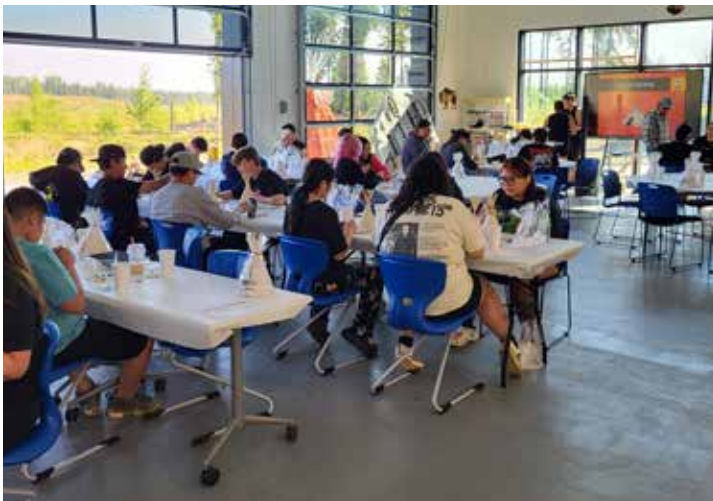
Treaty 8 Tipi Course.