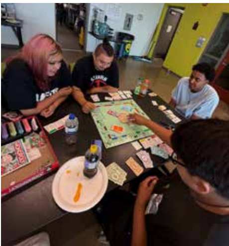
Summer Fun Sports Programs.