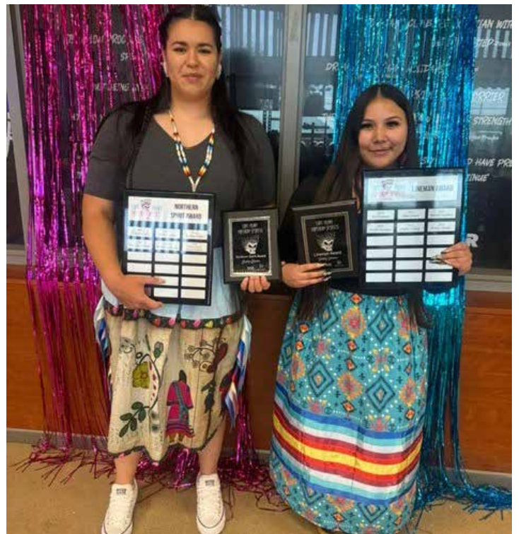
Northern Spirits Banquet.