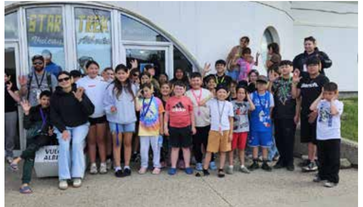
Wellness Centre Youth Cultural Excursion.