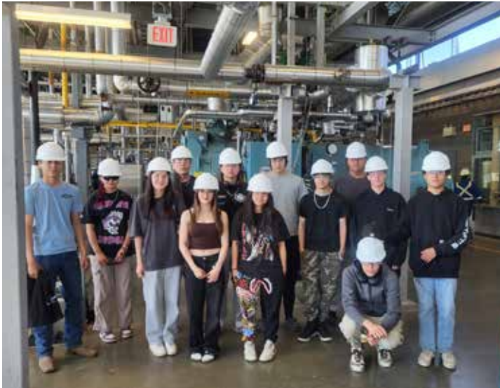
Summer Student Keyano Tour.